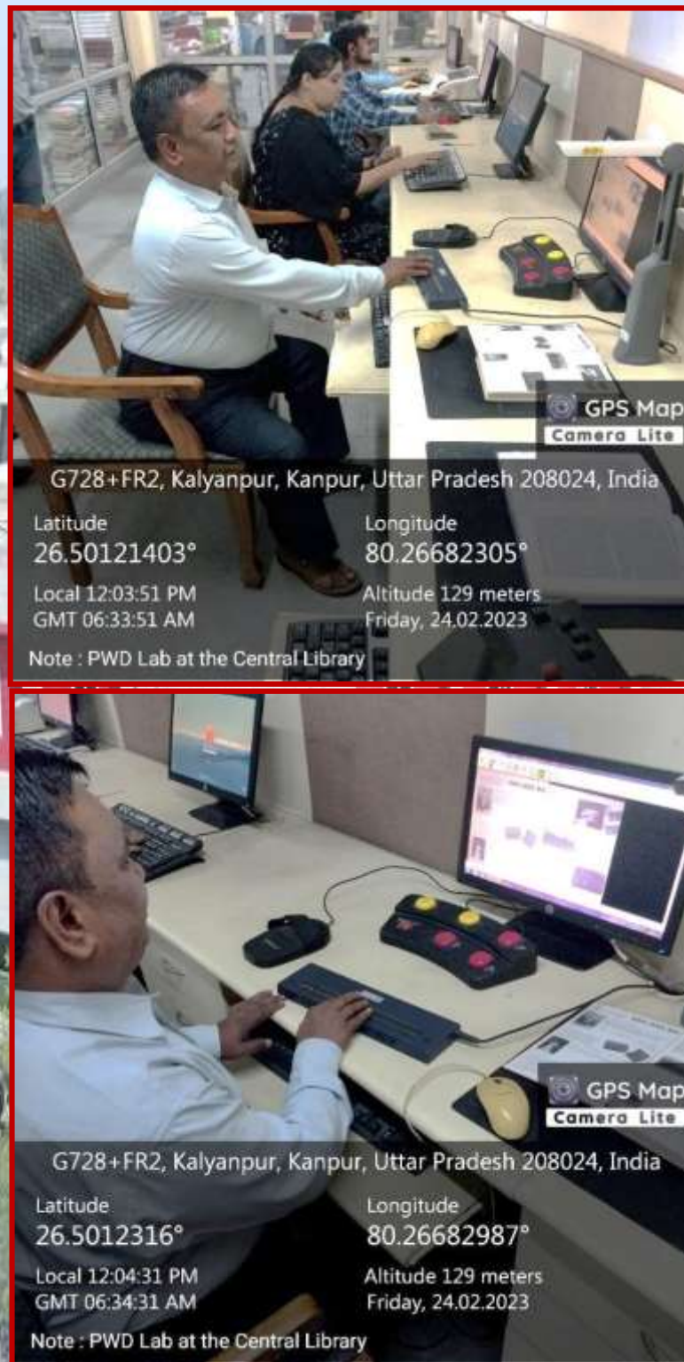
Fig. 1 & 2 Braille facilities for Divyangjan