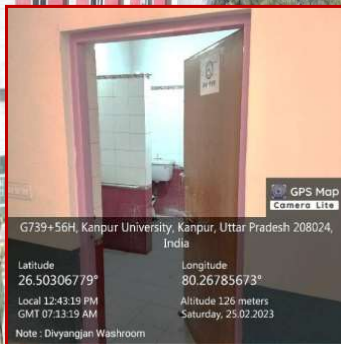
Fig. 1, 2 & 3 Divyangjan Friendly washrooms