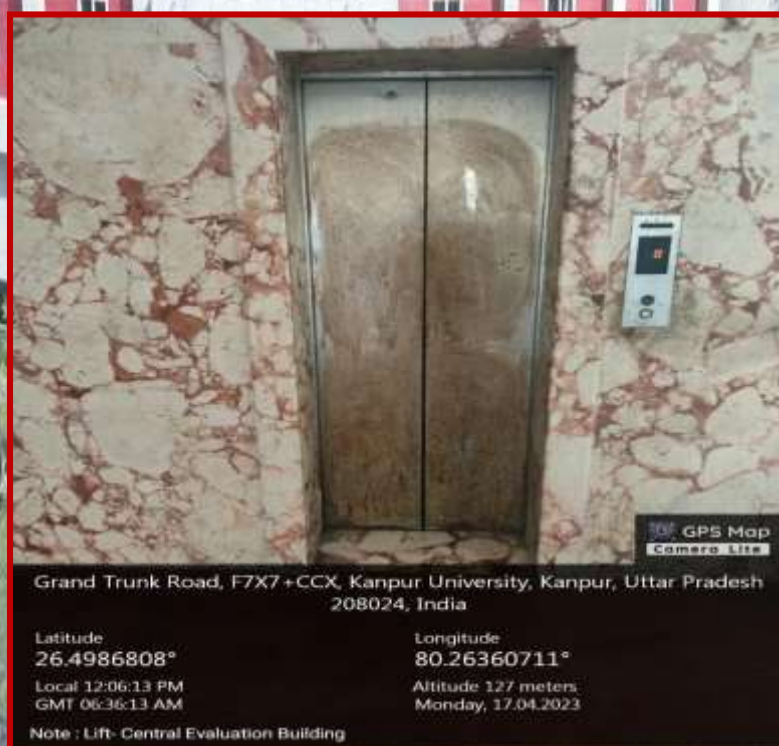
Fig. 5 & 6- Lifts at different departments