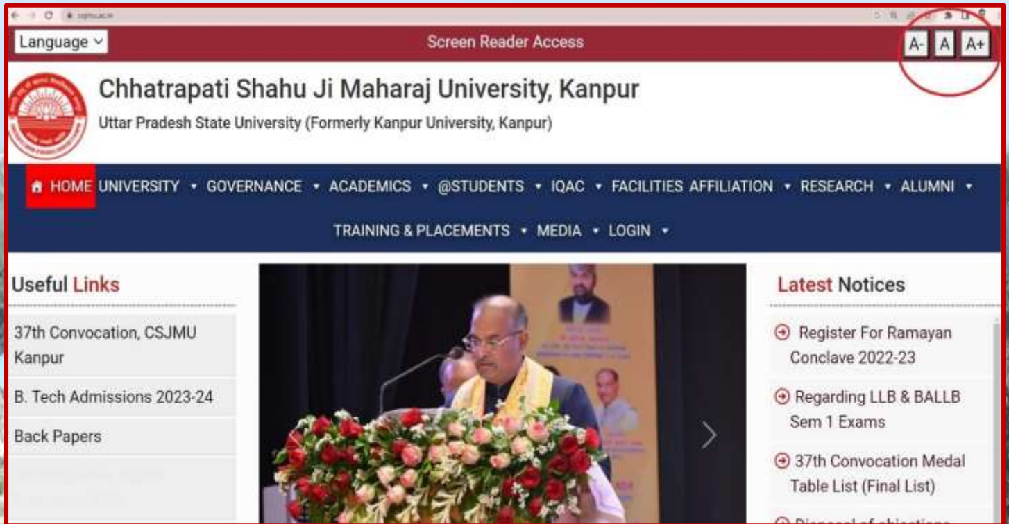
Fig. - Divyangjan Accessible Website, Screen Reading Software