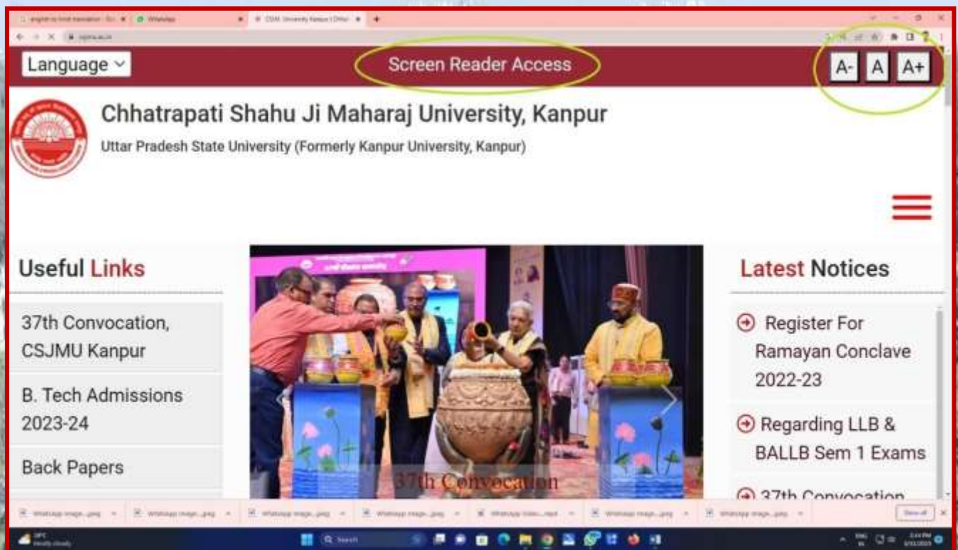
Fig. 3 Divyangjan Accessible Website, Screen Reading Software