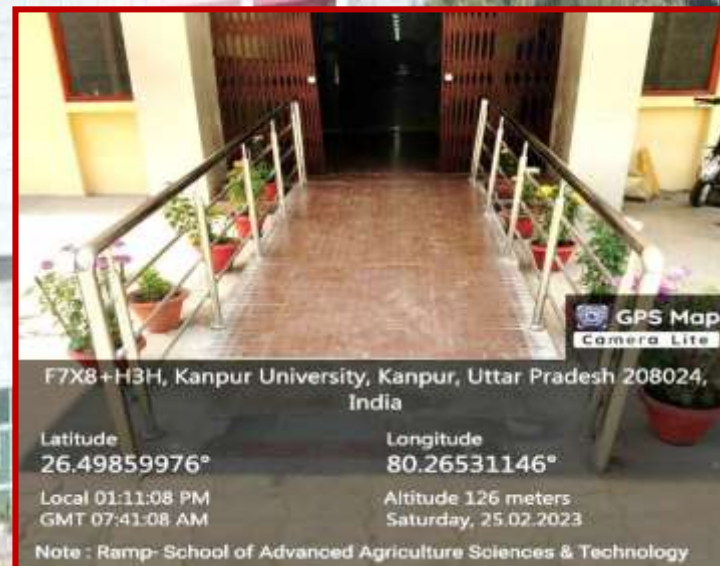
Fig. 1, 2, 3, & 4- Ramps at different departments